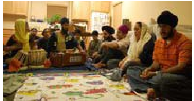
Sikh students gather at the MLC for Kirtan night.

In addition to the kirtan and meditation at kirtan night, there was also another tenet of Guru Nanak Dev Ji's being followed: Vand Chakna. By preparing a meal of some sort for the attendees, Sikhs got an opportunity to do seva, or serve others. Started by Guru Nanak Dev Ji himself to advocate equality, langar is a fundamental concept in Sikhism where anybody of any cast, sex, creed, or religion is given a free hot meal. Whether this was in the form of pizza, enchiladas, an indian meal of rice and daahl (lentil soup) or the plain old cookies and milk, students took turns in signing up for the langar following each kirtan night. Not only did students get a chance to do seva, but this also became a means of attracting more people to attend kirtan night, because as every college student knows a free meal in college is a luxury too good to pass up. In addition this food became a conversation starter for individuals of other faiths who wanted to learn more about Sikhism, or freshmen and other students who had never attended a kirtan night before.